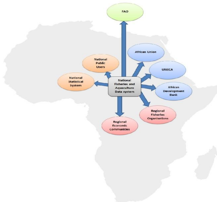
Figure 2 : Flow chart of the exchange of information from the national systems towards users

The flow chart for the sharing of information is presented in figure 2.