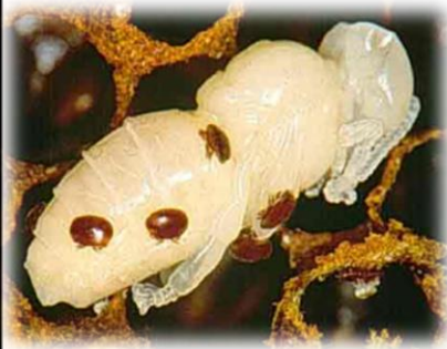
Bee pest: Varroa mite

Contribute to reducing the incidence of bee diseases and pests to improve honey production and pollination services for income generation and harmonise procedures and legislation relating to bee health issues in Africa.