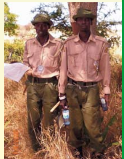
Scouts ready to walk a transect